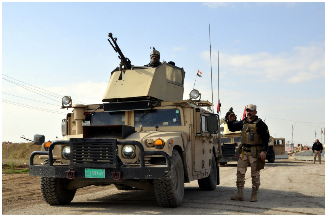
Iraqi army forces taking up position west of Mosul, Northern Iraq, March 2017